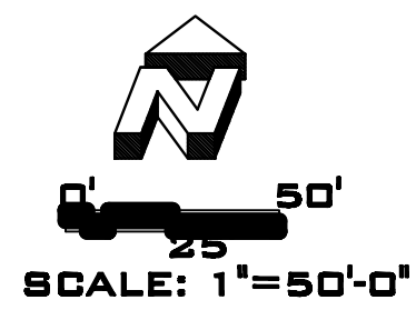
A 1 WEST PROPERTY OVERVIEW SCALE: 1"=50'-0"