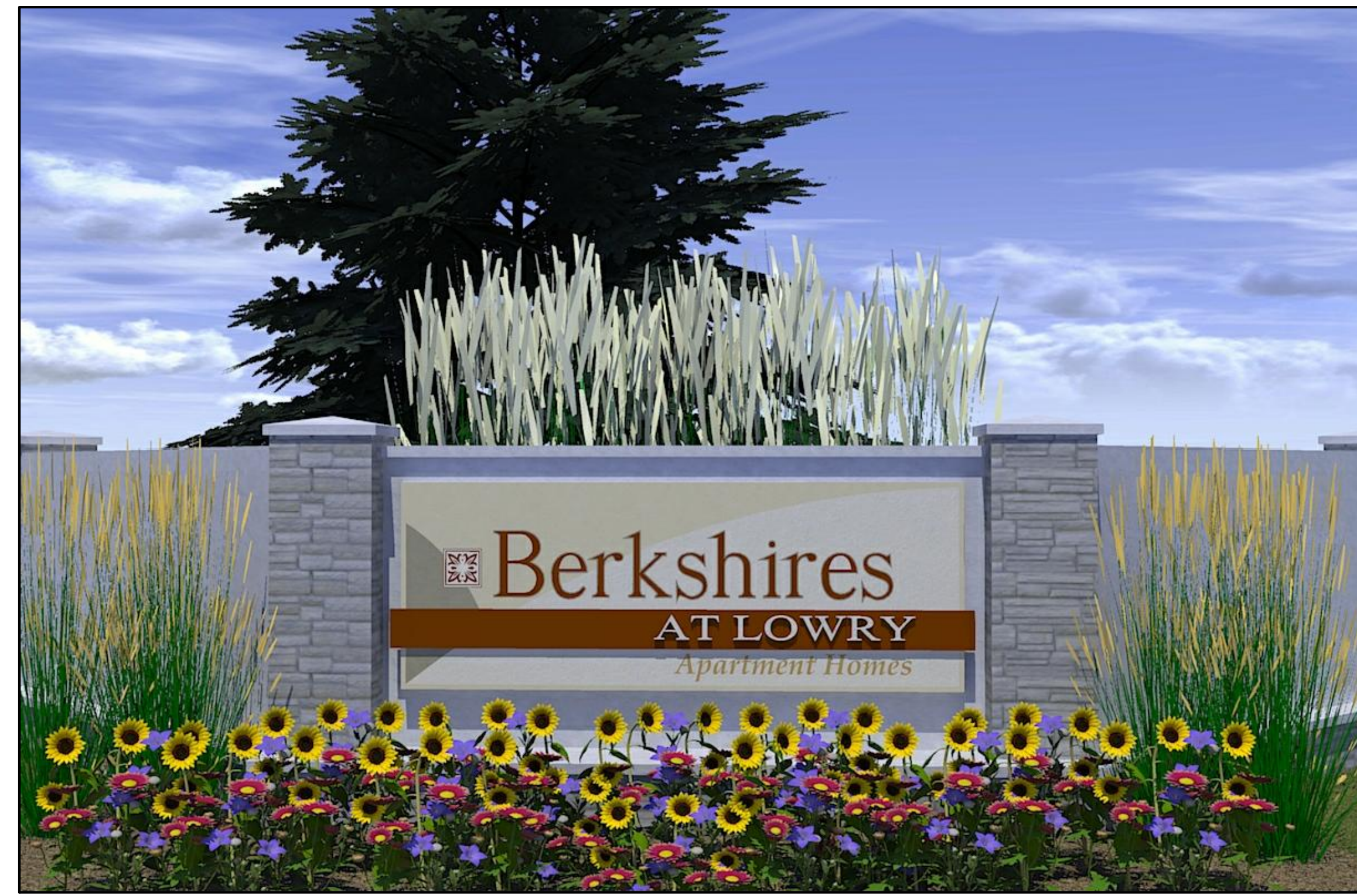
MAIN ENTRANCE RENDERING SCALE: N.T.S.